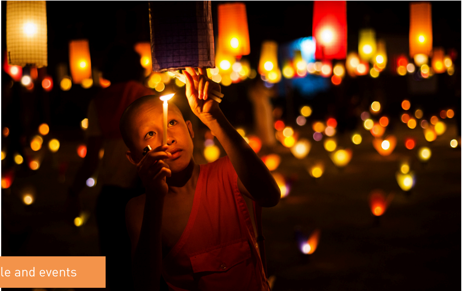
People and events