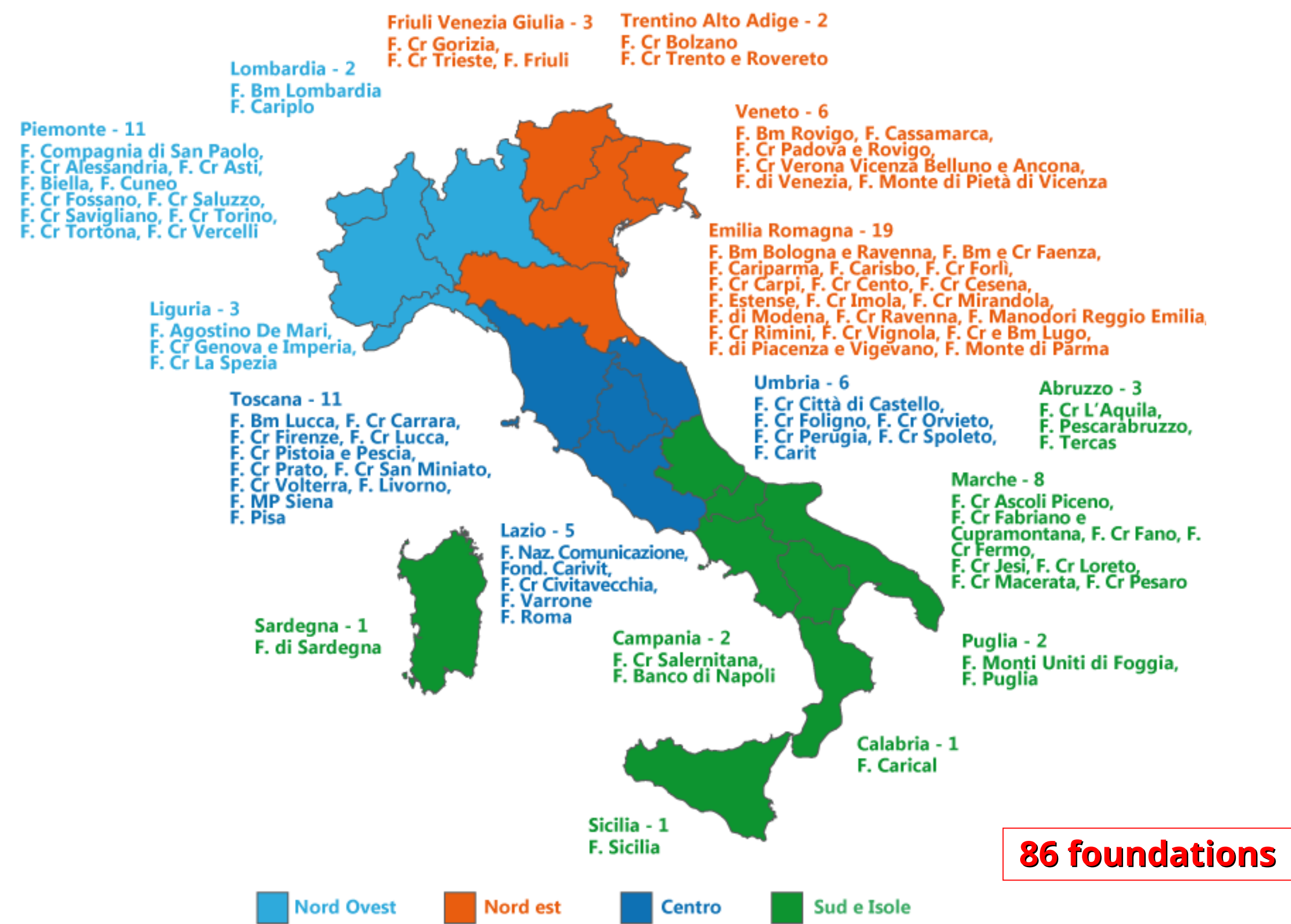
Fig.1 Distribution of banking foundations in Italy ( https://www.acri.it )