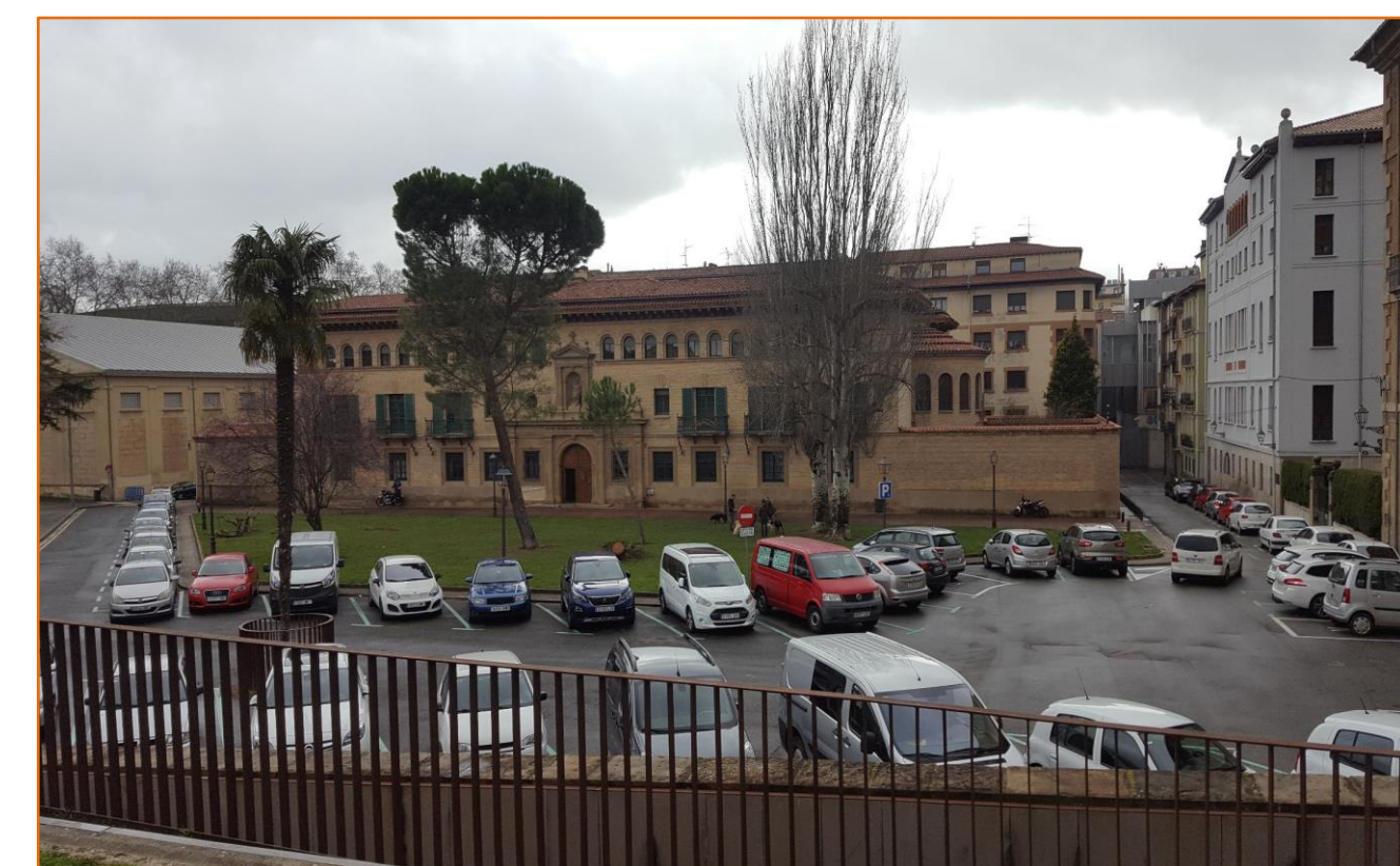
Fig. 2 Jewish quarter of Pamplona in 2022