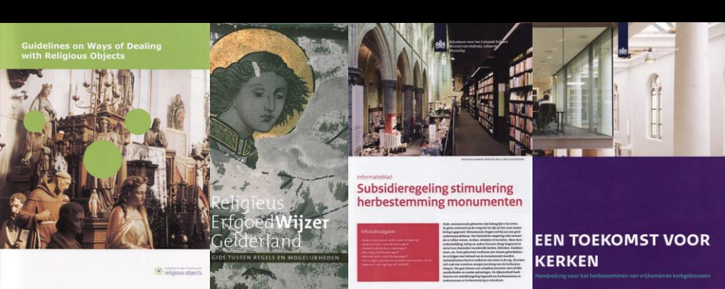
Handreiking religieus erfgoed voor burgerlijke en kerkelijke gemeenten