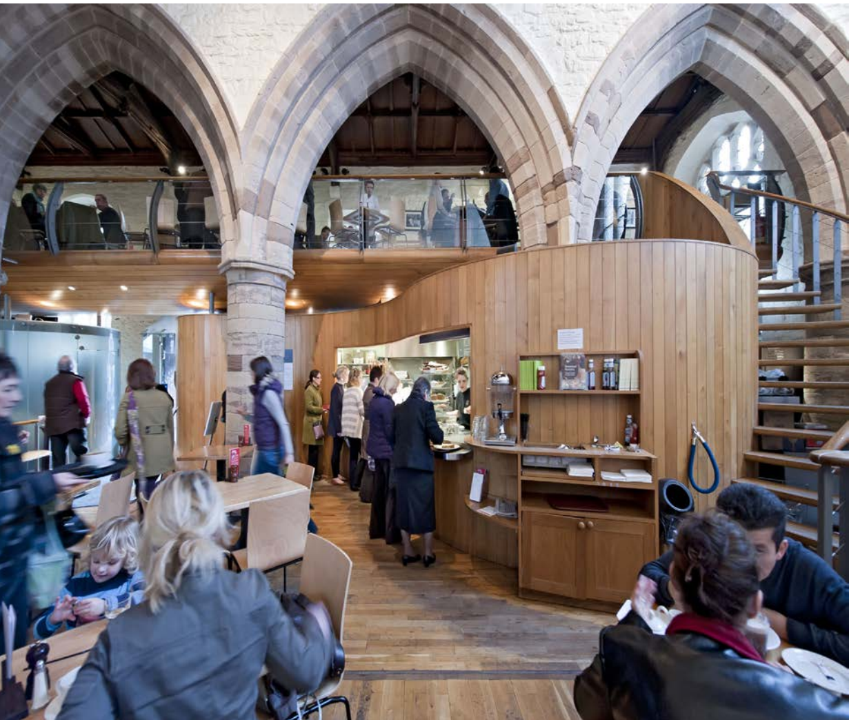
Permanent Café alongside worship