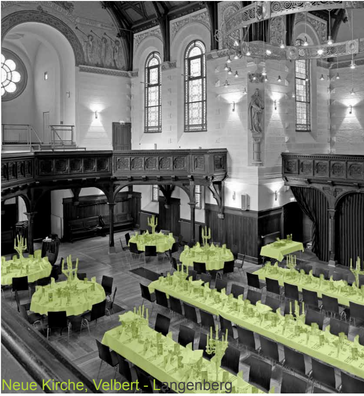
Neue Kirche, Velbert - Langenberg

The treatment of abandoned churches varies and differs in every country. It depends on factors like financial situation, heritage regulations or involvement of the public. How can the lost space of churches influence planning processes? How are processes organized and who participates in those processes?