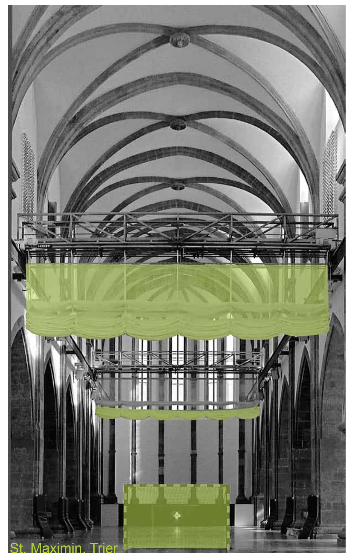
St. Maximin, Trier