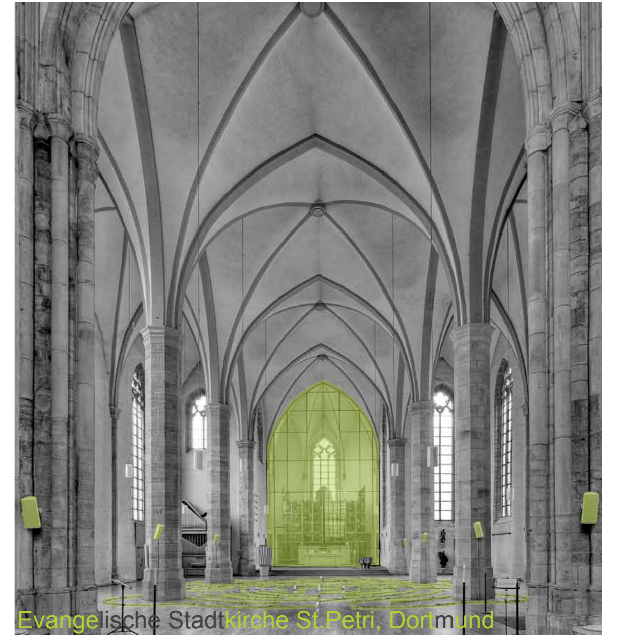
Evangelische Stadtkirche St. Petri, Dortmund

The treatment of abandoned churches varies and differs in every country. It depends on factors like financial situation, heritage regulations or involvement of the public. How can the lost space of churches influence planning processes? How are processes organized and who participates in those processes?